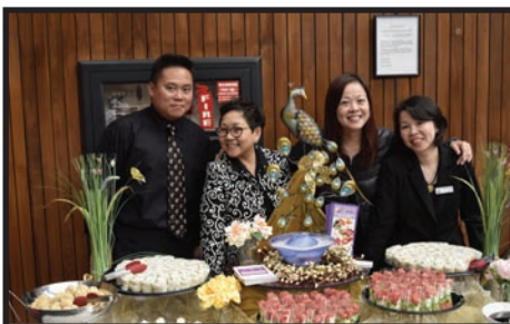
Moonstar Seafood Buffet at B2B Extravaganza Taste of Our Cities.