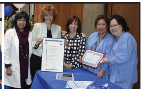
Seton Medical Center receiving awards for participating in the B2B Extravaganza.