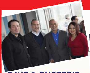
DAVE & BUSTER'S GRAND OPENING DECEMBER 15, 2016