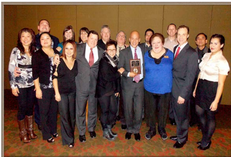
Graduation Ceremony for 12th Annual 2013 North San Mateo Leadership Forum

Then, the "2013 12th Annual North San Mateo County Leadership Forum" which held twelve sessions, every Friday morning from September 13th through November 22nd at De Vry