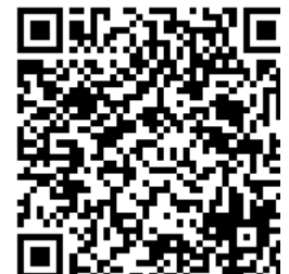
Click on Code to Access Link

Additional details about scheduling and route information can be found on the SamTrans website: http://www.samtrans.com/Assets/SamTrans/SCHEDULESandMAPS/Timetables/Daly+City+Bayshore+Shuttle+TimeTable.pdf or by calling Customer Service at 1-800-660-4287. Like us on Facebook at: www.facebook.com/samtrans or and follow us on Twitter @SamTrans_News and @GoSamTrans.