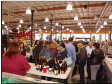
Business 2 Business Event at BevMo!

June of 1997, a new store opened in the shell of a now closed movie theater at 4915 Junipero Serra Blvd. in Colma CA. It was the latest in a string of BevMo! stores that had it's grand opening. Since June of 1997, the Colma store has risen in stature and has become the leading spirits store in the company, while always being in the top 3 for wine sales.