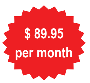
For the entire family + $100 Application Fee

Office Visit = $5.00Teeth Cleaning = $ 5.00 X - Rays = No CostDetailed Oral Exam = No Cost Fillings = $8.00Tooth Extraction = $ 10.00