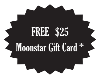
* After 1st month of valid membership. Mention this flyer. No expiration.

SitRossFamilyCare@yahoo.com www.ross.awiscard.com