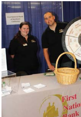
Business to Consumers Showcase September 10, 2011