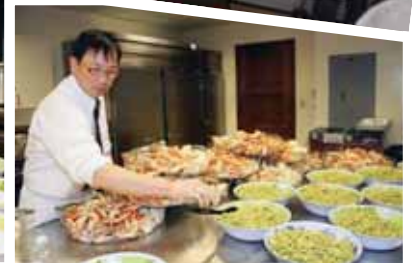
3rd Annual Crab Feed Fundraising Dinner Colma Community Center - March 10, 2011