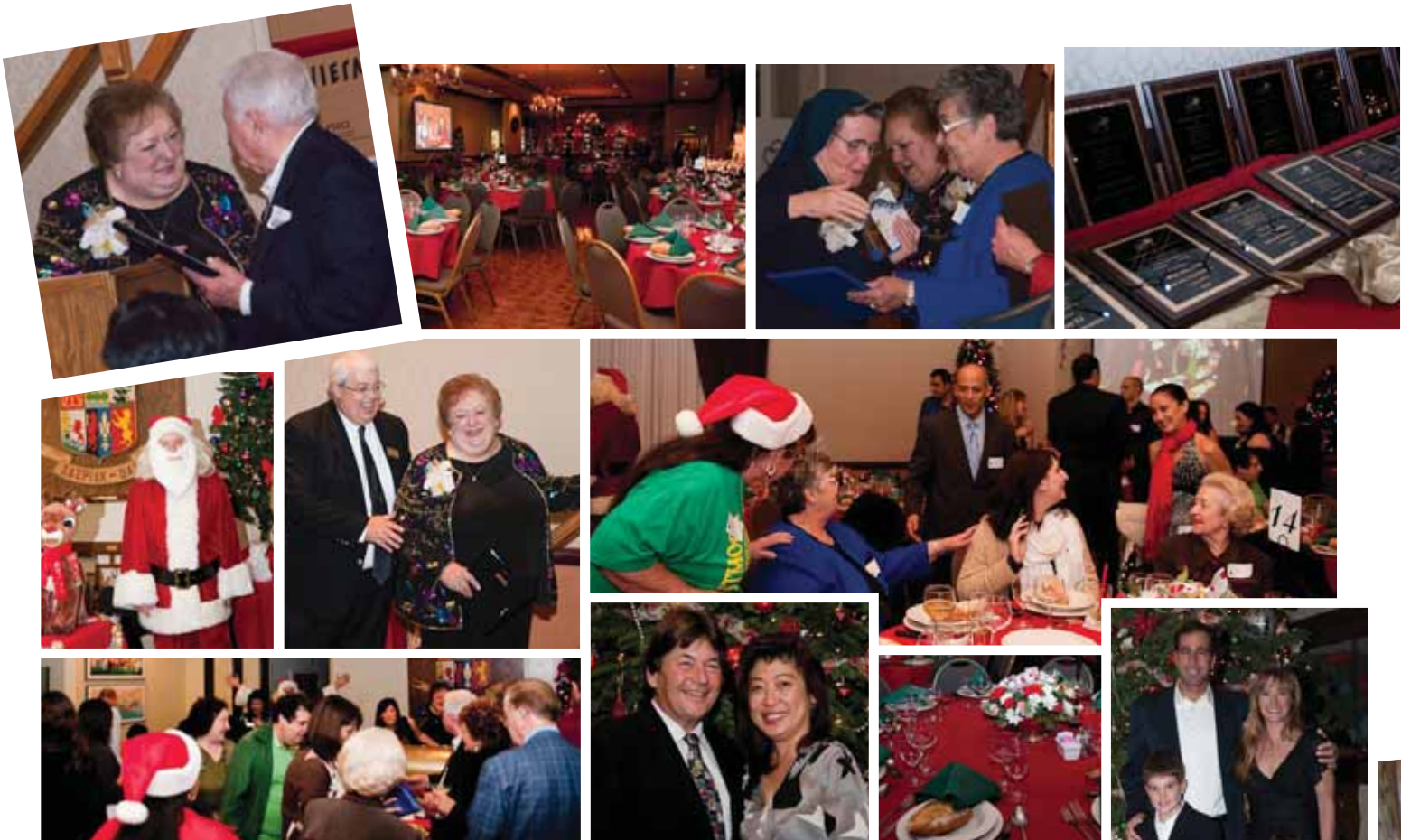
57th Annual Cypress Business Awards & Holiday Soiree Thursday, December 9, 2010 at Basque Cultural Center