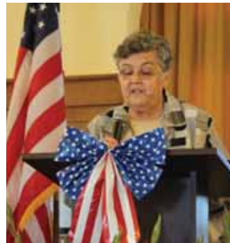
State of Our Cities Address - January 27, 2011 With Special Guest Speakers: Hon. Carol L. Klatt, Mayor of Daly City & Hon. Helen Fisicaro, Mayor of Colma