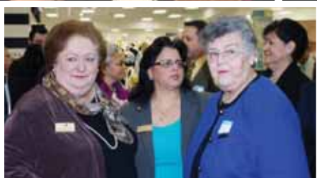
JC Penney Grand Opening Ribbon Cutting Serramonte Shopping Center March 4, 2011