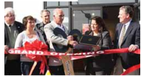
KIA Serramonte Dealership Grand Opening Ribbon Cutting Colma - Friday, February 4, 2011